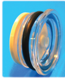
with reflector, size 22